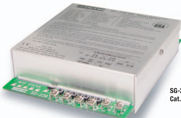
SG-239 Cat. # 54-22

Get quality performance from a low cost package. The SG-239 will operate from 1.8 to 30MHz with 1.5 to 200W. It has over 130,000 possible tuning combinations and 170 memory bins for fast, accurate tuning. Like all Smartuners, it gives you the most flexibility because it will work with any antenna and any transceiver. It also has push buttons for a manual tune option.