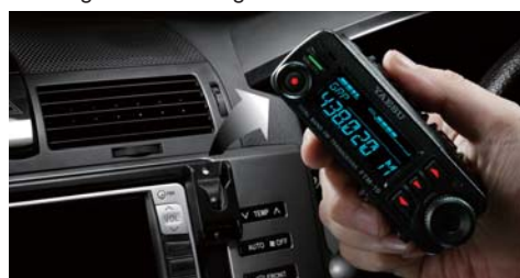
• Hanger Bracket

• The microphone and PTT button are built into the front panel. Detach the front panel with one-touch release when transmitting! The detachable front panel may be separated from the main chassis, and attached to a flat metal surface with the magnetic mounting bracket.