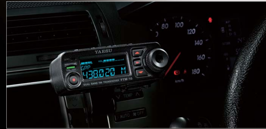
2 m/70 cm Band FM Dual Band Transceiver (2 m 50 W / 70 cm 40 W) FTM-10R/E*

YAESU Choice of the World's top DX'ers SM