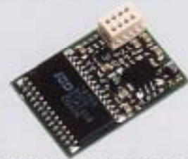
Digital Voice Recorder DVS-4