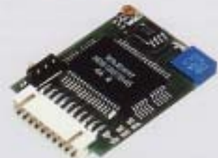
Voice Synthesizer Unit FVS-1A