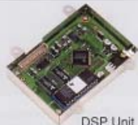
DSP Unit DSP-1